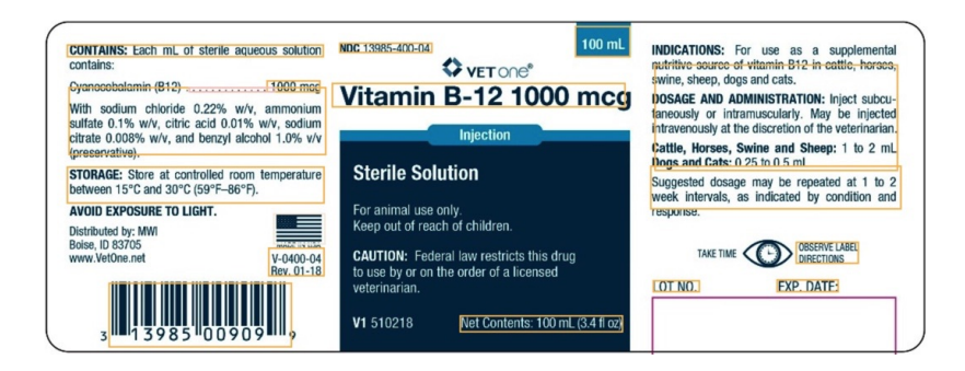
Figure 6: Example of a layout analysis by the PRImA-trained model

In order to approximate training on a large database of labels, we began by testing the performance of a model trained on a near-match dataset. Although the resemblance is not perfect, the PRImA Layout Analysis Dataset, composed of 305 annotated scans of magazine pages, contains documents with layouts reasonably similar to those of the labels we wished to analyze (PRImA, 2009-2022). Text is generally broken out into multiple columns, and images, tables, and colored titles appear in most items. We used an R-CNN model pre-trained on these documents to test the viability of PRImA as a representation of our desired use case. We ran the model on a clean sample image of a scanned label to avoid any complications due to poor image quality.