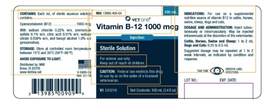
Figure 8: Example of a layout analysis by the fine-tuned model

In order to improve the model's performance for our use case, we compiled a small dataset of 142 scans of flattened labels for the purposes of fine-tuning, sourced from dai-lymed.nlm.nih.gov, fda.report, and company websites. We hand-annotated these images in the COCO format using closely-fitting polygons, in the same way the original PRImA dataset was annotated, and split 100 of the images into a training set. Figure 7 displays a sample layout analysis by the resulting model, with bounding boxes now delineating broader regions of text. The remaining 42 images were used as a validation set, and a mAP score of 0.652 was calculated for the fine-tuned model.