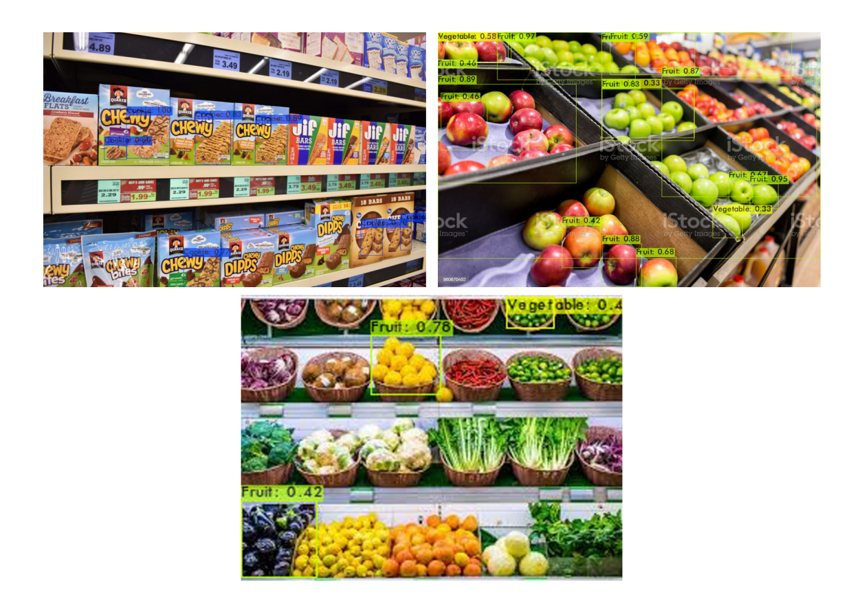
Figure 1: Object recognition of common grocery items