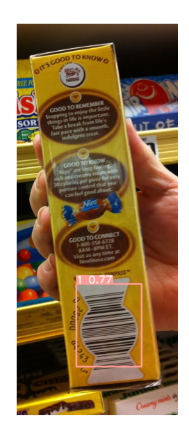
Figure 3: Barcode object detector

must be moved in order for it to be successfully scanned. This minimizes the need for users to guess at proper object positioning.