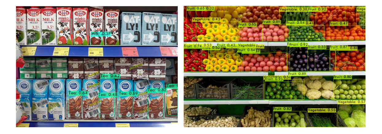
Figure 2: Inaccuracy in object recognition of grocery items

on the other hand, can be achieved at a greater distance and within a less strictly defined region. We have implemented a voice interface which assists the user in positioning the barcode by directing them through a series of verbal instructions, describing how an object