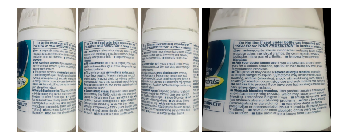
Figure 5: Example of label images prior to stitching, followed by a composite image

Following the creation of a composite image, a layout analysis must be applied to identify continuous columns of text. While there are a number of established, annotated datasets available that are suitable for training models to perform a layout analysis, none were found that specifically addressed the use case of bottle packaging. Labels employ formatting that is distinct from that of text documents like academic papers or magazines, leading to discrepancies between the variety of annotated data available and the items we wished to analyze. Additionally, it was rare to see labelling of full columns rather than paragraphs reflected in the existing data.