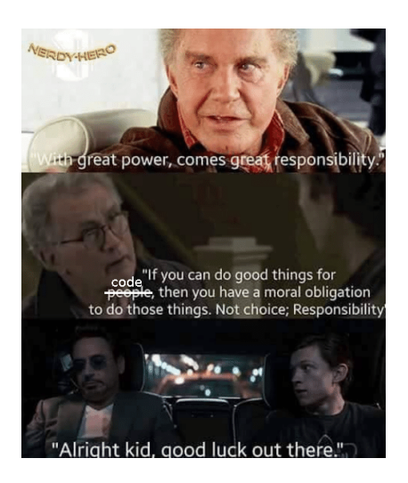
All of these apply to our context..