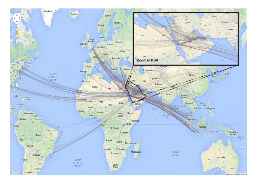
Figure 3: Where did the Saudis Spent the Spring Break of 2014.

round the year, our tool gives top vacation spots based on a particular holiday by using Twitter data. VacationFinder can be used by the government agencies to promote tourism in the country. It could also be used to do planning before any vacation. Similarly, media industry can use this application to find out where to focus for a particular holiday. Other businesses such as restaurants and shopping stores can use the information to open new stores and also to find out how many workers needed during a specific holiday.