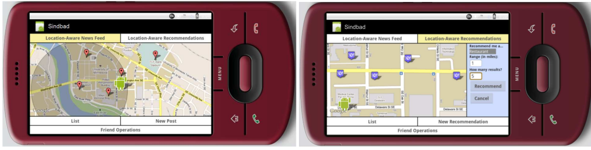
(a) Location-Aware News Feed