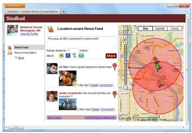
Figure 2: Sindbad Web Application ScreenShot

Sindbad produces recommendations using non-spatial user ratings for spatial items by employing a travel penalty technique that accounts for item locations embedded in the ratings. This technique favors recommendation candidates the closer they are in travel distance to a querying user. Sindbad employs an efficient query processing framework capable of terminating early once it discovers that the list of recommended items cannot be altered by processing more candidates. Finally, to produce recommendations using spatial ratings for spatial items , Sindbad employs both the user partitioning and travel penalty techniques to address the user and item