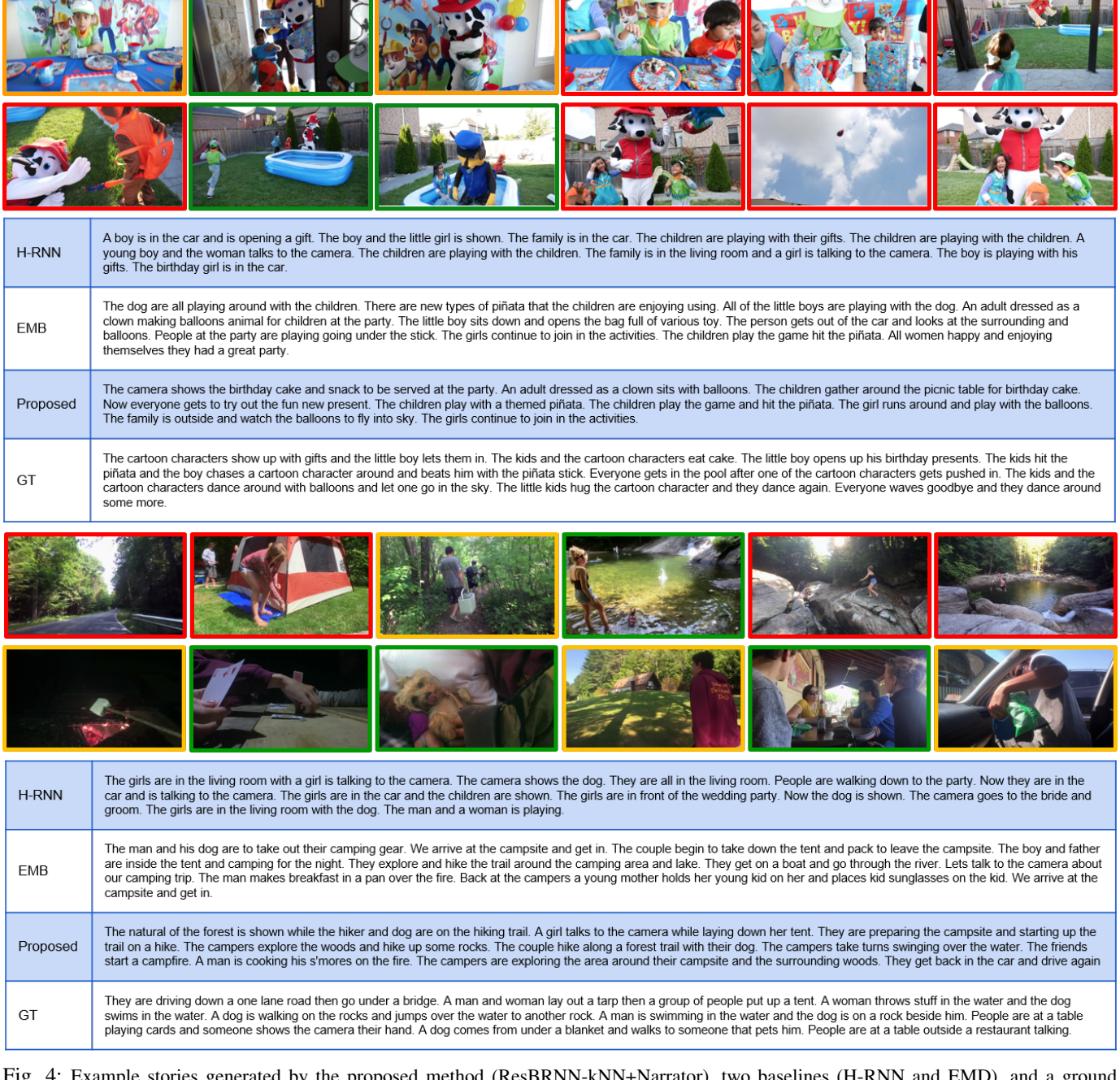
Fig. 4: Example stories generated by the proposed method (ResBRNN-kNN+Narrator), two baselines (H-RNN and EMD), and a ground truth. The frames are handpicked from the set of clips proposed by Narrator and the ground truth example. Green boxes highlight the frames from GT, orange boxes highlight the frames from Narrator proposals, while red boxes highlight frames shared by both.