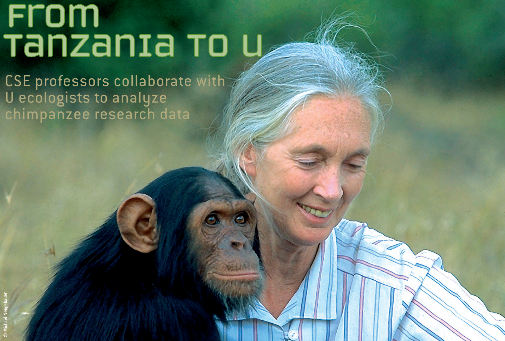
Dr. Jane Goodall with an orphan Chimpanzee at the Tchimpounga Sanctuary in the Republic of Congo.