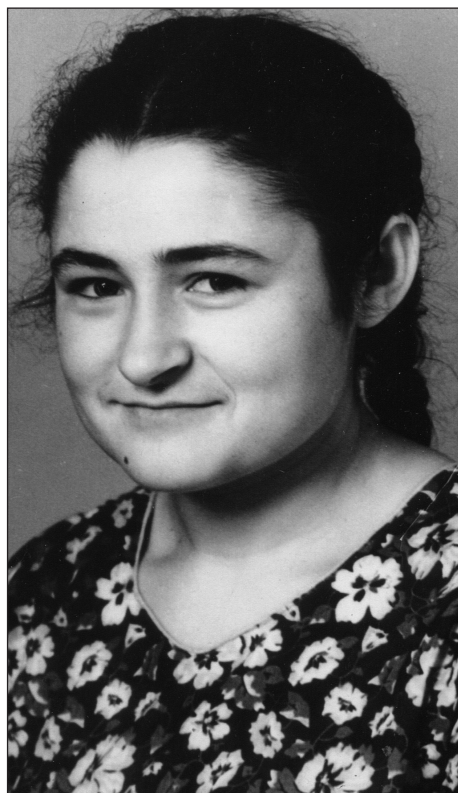
Photo courtesy of Ilya Muchnik. Picture quality improved by Poline Tylevich.